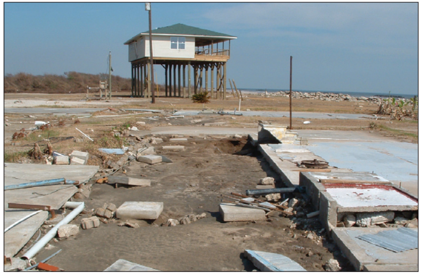
Constance Beach, Cameron Parish, after Hurricane Rita. While the structure in the foreground was washed away by Rita's storm surge, the home in the background escaped destruction because it was properly elevated.

The guidebook presents basic strategies that can help planners, managers and property owners in coastal communities better prepare