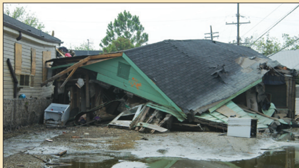
Air pressure and uplift pulled this roof from a building. These forces can be mitigated against through use of stronger connections to the structure, as outlined in the Louisiana Coastal Hazard Mitigation Guidebook .

Although Hurricane Katrina was the most destructive and costliest tropical cyclone in the history of the United States, many previous storms were likely more powerful and certainly there are more storms in the state's future. Individuals and local governments can take the lead in protecting lives and property by implementing techniques discussed in the Louisiana Coastal Hazard Guidebook .