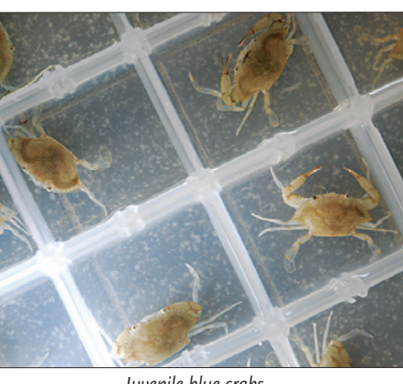
Juvenile blue crabs.

Juvenile crabs had a 75 percent survival rate after 96 hours in concentrations of 1,000 parts per million of Corexit. Levels in the Gulf at the time of the oil spill were estimated to be about 1 part per million. Anderson concluded that blue crabs in the Gulf would have easily survived exposure to the dispersant, as well as most larval crabs.