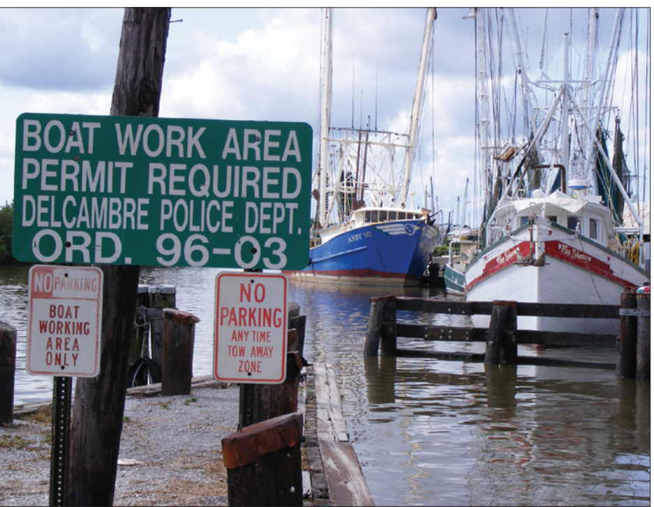
The Port of Delcambre once had more than 100 shrimp boats in its fleet. Today, there are fewer than 30. The Delcambre Direct program is helping revitalize the fishing community.