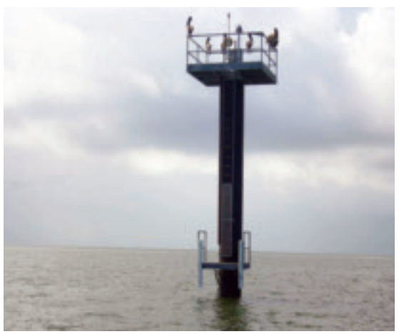
Mississippi Department of Marine Resources

Top: Oysters have been identified as possible indicators of ecosystem health.