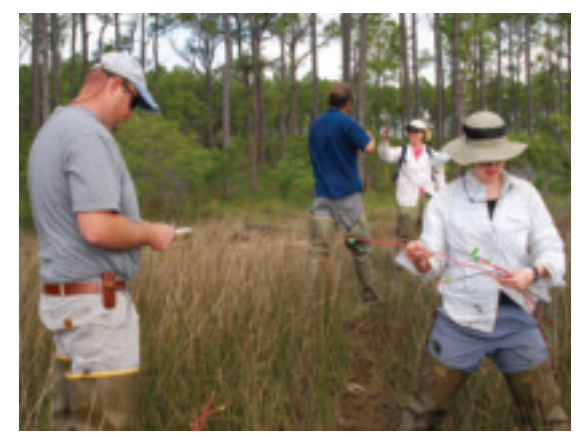
Mississippi-Alabama Sea Grant Consortium

Related ORPP Themes: Increase Resilience to Natural Hazards, The Ocean's Role in Climate