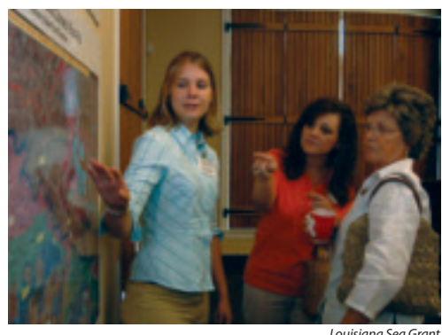
A Louisiana State University graduate assistant explains storm surge maps to residents in Iberia Parish, Louisiana.

These needs have been shared with groups working in the Gulf of Mexico, and the complete list of non-research needs identified by stakeholders is available online at masgc.org/gmrp/report.htm.