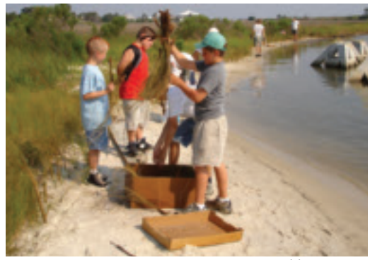
Boy Scouts take part in a habitat restoration project on Dauphin Island, Ala.