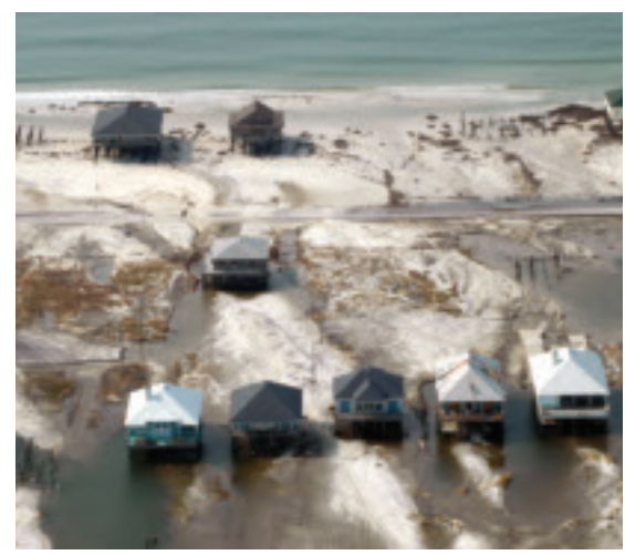
Dauphin Island Sea Lab

Top: Scientists conduct research in a black needlerush marsh.