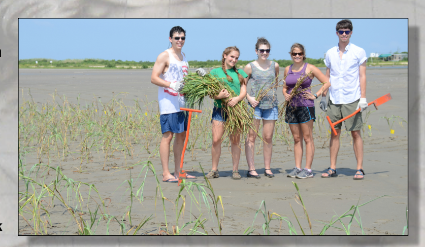
Legal interns have the opportunity to travel during their time with Louisiana Sea Grant. Above, interns participated in a coastal restoration outreach project on Grand Isle.

Our legal interns can work up to 20 hours a week.